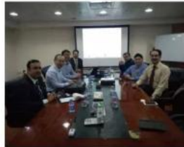
Foreign customer visit