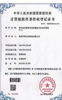
Software copyright registration