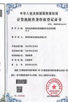
Software copyright registration