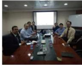
Foreign customer visit