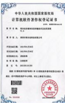
Software copyright registration