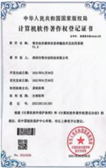
Software copyright registration