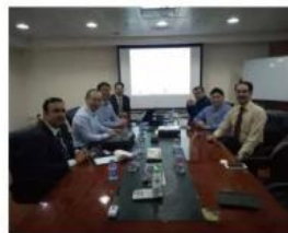
Foreign customer visit