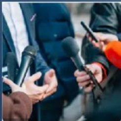
Radio & Television Transmission