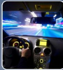
Portable 5G base station