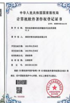
Software copyright registration