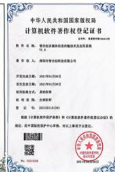
Software copyright registration