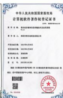
Software copyright registration