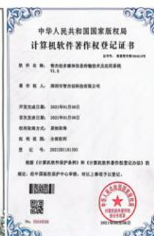
Software copyright registration

GreatCQ Shenzhen Zhijie Chuang Technology Co., Ltd.