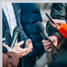
Radio & Television Transmission