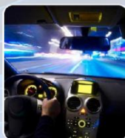
Portable 5G base station